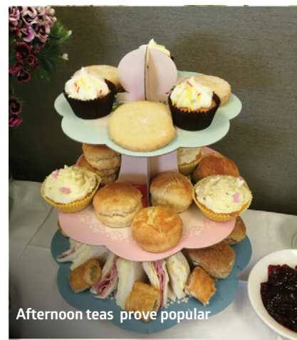
Afternoon teas prove popular