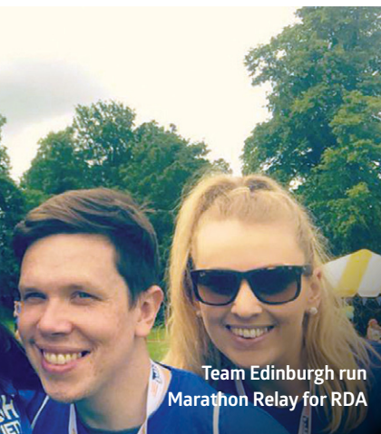
Team Edinburgh run Marathon Relay for RDA